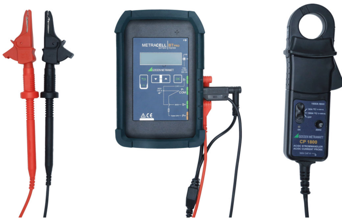
Figure 2: Battery tester with AC/DC current clamp sensor CP1800 (Z204A)