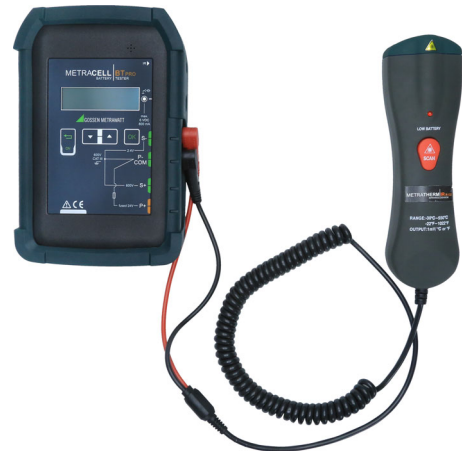
Figure 3: Battery tester with temperature sensor METRATHERM IR BASE (Z680A)