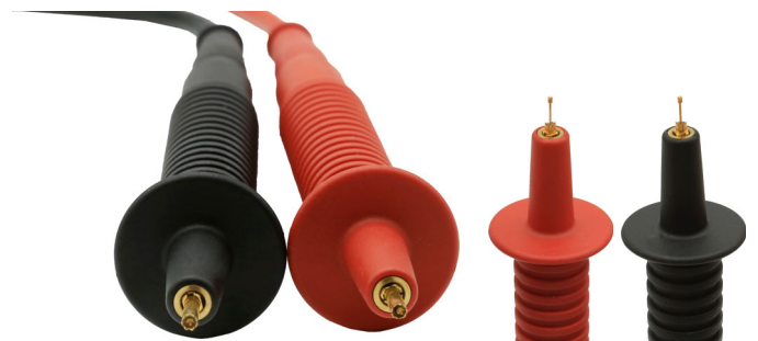
Figure 4: Kelvin probes with spring-loaded contact pins