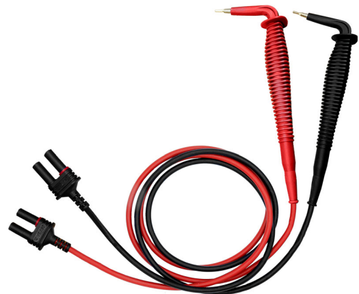
Figure 5: Angled probes for 4-wire measurement (Z227W)