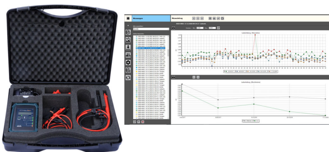
Figure 1: Carrying case (left), analysis of measurement data (right)

Periodic testing and well-organized maintenance are necessary in order to assure the availability of stationary battery systems. The METRACELL BT PRO is a universal, multifunctional test instrument for user-friendly, professional maintenance of these battery systems. It can be used to determine the current status of the battery or battery block and pinpoint hidden battery defects. The battery tester is used primarily for testing stationary battery systems.